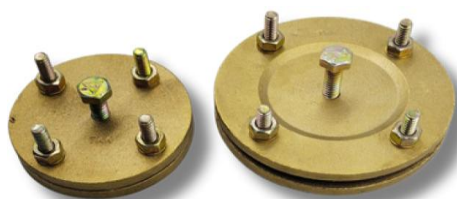
Plate Type Tape Clamp