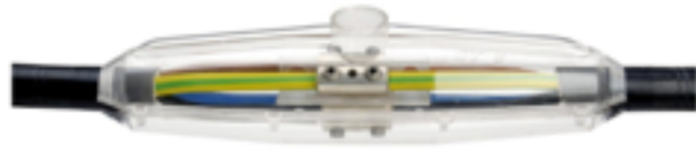
Low Voltage XLPE/PVC Insulated Cables Max. Cross Section Per Conductor mmsq